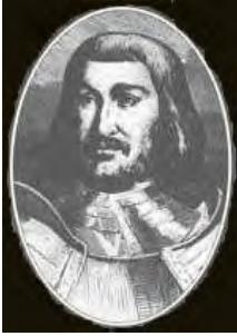
Bloody baron: Gilles De Rais